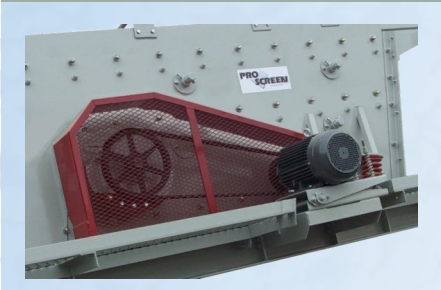
20 HP TEFC motor w/3 belt drive & guard.